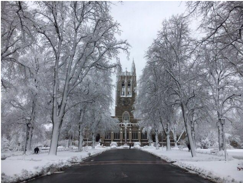
The trees on Linden Lane have grown in 100 years but Gasson remains the same!